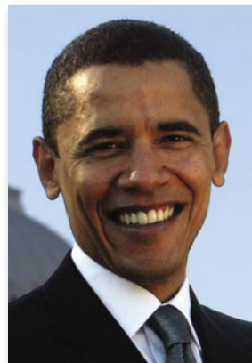
Sen. Barack Obama (D-IL) www.barackobama.com/issues